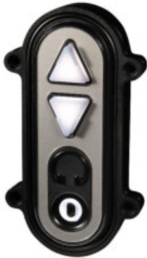
Figure 3. Tactile discernable sound volume controls must be easily accessible to those using assistive headsets, earpieces or hearing aid devices and those using headsticks or easy-grip styli.