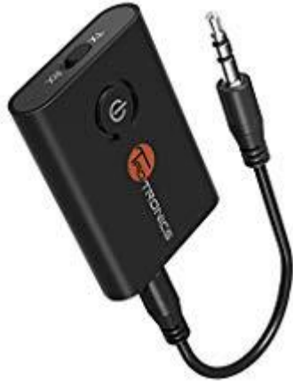
Figure 4: Compact wireless transponder. These devices can be paired with a wireless headset or earpiece to provide a private listening capability. The transponder can be plugged directly in to the kiosk's audio jack socket. Other brands and types of transponder are available.