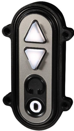
Figure 3. Tactile discernable sound volume controls must be easily accessible to those using assistive headsets, earpieces or hearing aid devices and those using headsticks or easy-grip styli.